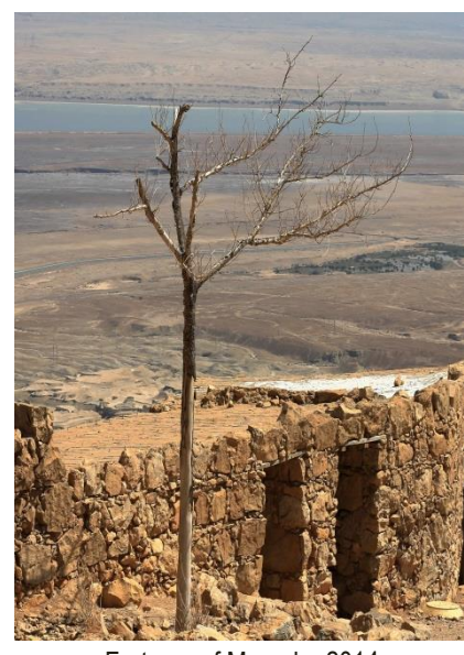
Fortress of Masada, 2014

The prophet Habakkuk envisioned a season of extreme hardship where crops, herds, and flocks all failed. Instead of relying on food and drink, he rejoiced in the Lord who became his strength. No other attitude or activity generates strength like that derived from the Lord. The Hebrew word chayil refers to might, ability, efficiency, wealth, and/or military force. In the context of a devastating famine, Habakkuk used this word to punctuate the lyrics of a prophetic song.